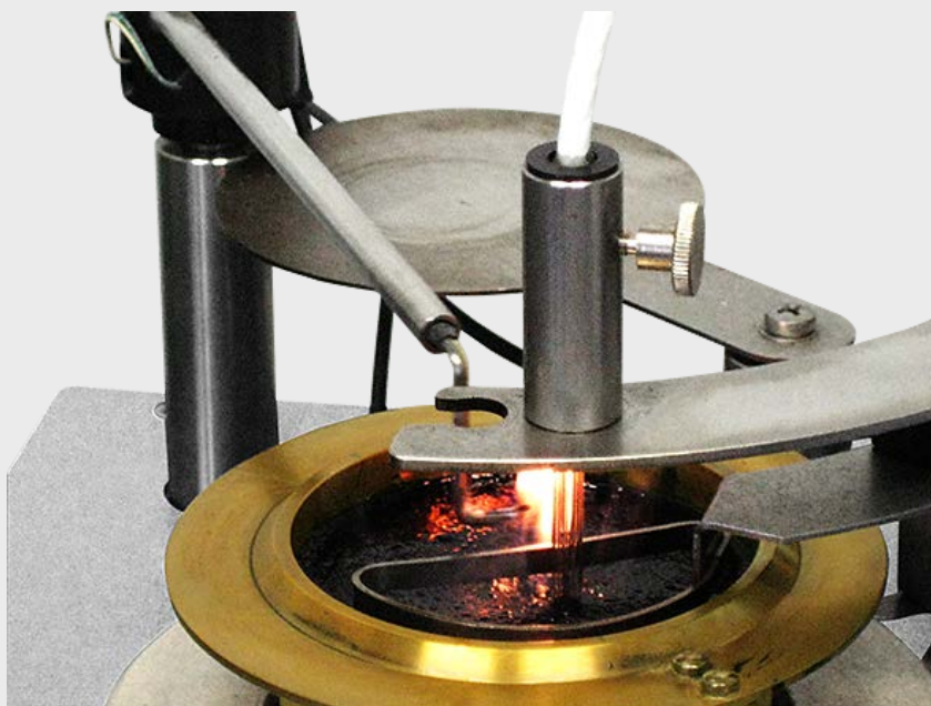
Fig. 1 Cleveland flash point test with CLA 5

When a surface skin is present, the flash point detection will fail, because the flammable vapors cannot evaporate from the sample and therefore cannot be ignited by the test flame.