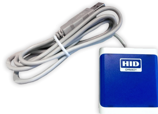
GO NFC Pad Reader