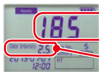
Image of Display