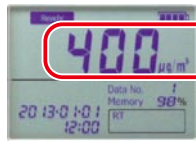
Image of Display