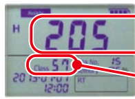
Image of Display