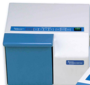
Stomacher® 80 Biomaster